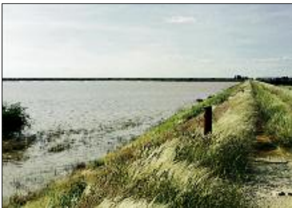
Omatako Dam, a dam site vulnerable to high evaporation

It may be reasoned that in areas where surface water use is limited, one rather expensive option is to import the water required over long distances from other surface or groundwater sources, however, the use of local groundwater sources is still the most appropriate and cost-effective