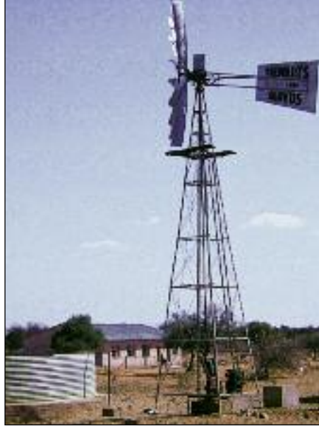
Windpump and borehole installation

Although Namibia is an arid country, its finite water resources are sufficient to sustain continuous growth and steady development of the Nation. There are however great variations in the availability of water. At the southern, northern and north-eastern borders where surface water is available throughout the year from perennial rivers, there is an excess rather than a shortage of water, although this is shared with neighbouring countries. The rest of the country either relies on dams constructed in ephemeral rivers that have low safe yields in comparison to their total volume, because of drought and high evaporation losses, or on groundwater. The total, overall groundwater resources are sufficient to assure long-term water supply if used sustainably, yet there are great regional variations. In many areas, groundwater conditions are unfavourable due to limited water availability, little and unreliable recharge, low borehole yields, great depths, poor groundwater quality and high risks of conta-