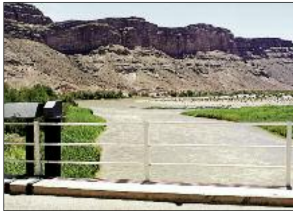
Orange River at the Noordoewer Bridge

Thus it is obvious that Namibia could not survive without using its precious groundwater resources. However, although groundwater had been sought and used for more than a century, the occurrence, magnitude and potential of