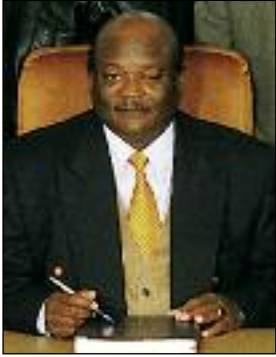
Honorable Minister Helmut K Angula

Water is essential for the survival of mankind and the natural environment. Social welfare and economic development cannot be sustained without reliable water supplies, and this is particularly true of arid countries, such as Namibia, where water resources are extremely limited and highly valued as a social and economic good.